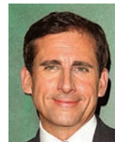
► Steve Carell

A: “I’m going back every now and then as a guest,” says Ling, 38. “And I wouldn’t rule out doing something more, but not for a while.” For now, she’s focusing on her documentary series, Our America with Lisa Ling ; season two premieres tonight on OWN (10 p.m. ET) and will cover topics including post-traumatic stress disorder and polygamy. Read more at Parade.com/ling .