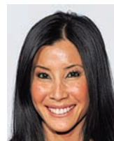
► Lisa Ling

A: The actor, 49, has a few films in the works and is co-executive-producing Showtime’s Laughing Stock , a series due in early 2012 that features interviews with top comedians. But he also wants to spend more time with his family. “I have little kids, so I wanted to make sure that I was around as much as I could be for their childhood,” he has said.