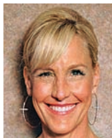
► Erin Brockovich

A: “My background is with the military, where my job was teaching combat survival,” the 37-year-old Man vs. Wild host, who spent three years with the United Kingdom Special Forces, has said. Grylls’s love for adventure began early: When he was 8, his father taught him mountain-climbing, and 15 years later he became one of the youngest Brits to reach the peak of Mount Everest.