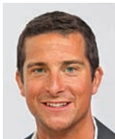
► Bear Grylls

Q: How did Bear Grylls get so knowledgeable about survival skills?