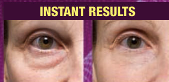
BEFORE AFTER 90 Seconds