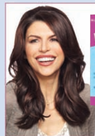
Finola Hughes, Emmy Award-Winning Actress