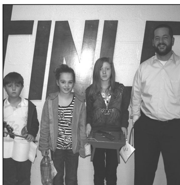
Winners from Crystal Lock's class.