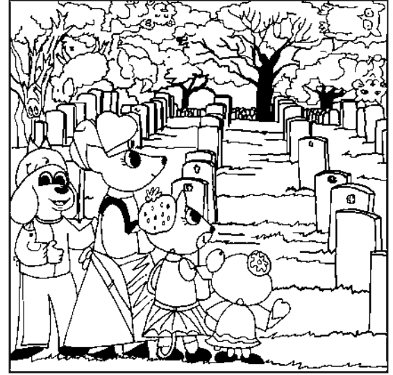
from The Mini Page © 2011 Universal Uclick

Mini Spy and her friends are visiting Arlington National Cemetery on Memorial Day. See if you can find: • olive • dog • number 2 • frog • tooth • elephant's head • tea pot • doughnut • two hearts • bell • sailboat • word MINI • number 7 • sheep • owl • strawberry • man in the moon • umbrella