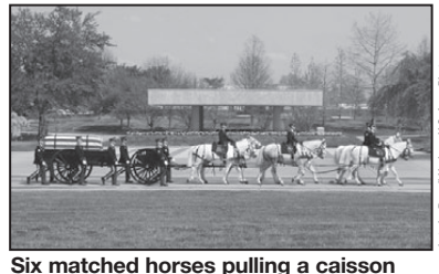
Six matched horses pulling a caisson with a flag-draped casket are a part of some military funerals.