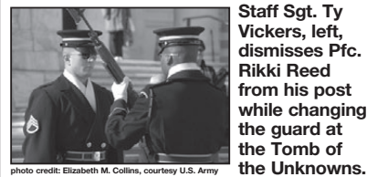
The changing of the guard ceremonies are held during the daylight hours. The guards are changed every hour during the winter and every half-hour during the summer. There are also sentinels on duty at night.

A lone tomb guard takes 21 steps as he walks back and forth on a mat in front of the tomb. He stops at each end of the mat, turns around, and faces nearby Washington for 21 seconds before he turns again. The 21 steps and seconds stand for the 21-gun salute, the highest U.S. salute.