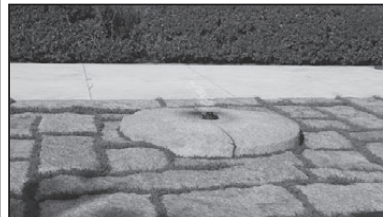
Kennedy's grave is marked by an eternal flame (a flame that is never put out). Also buried there are two of his children and his wife, Jacqueline Kennedy Onassis. His brothers Robert F. Kennedy and Edward M. Kennedy are buried nearby.