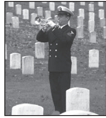
A bugler playing "Taps" is a part of many burials.

About 28 service members or their family members are buried every day at Arlington National Cemetery. The flags in the cemetery fly at half-staff from a half-hour before the first funeral to a half-hour after the last funeral.