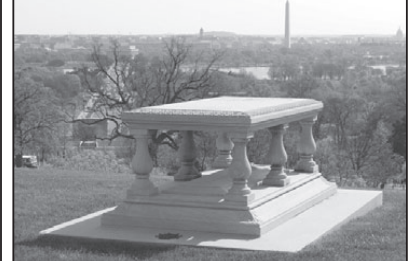
Pierre Charles L'Enfant's monument

Nineteen of our country's astronauts are buried at Arlington. Sixty-two people from other countries also are laid to rest there. Twenty-four of them are British.